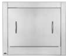
Stainless Steel Seasonal Cover (optional)