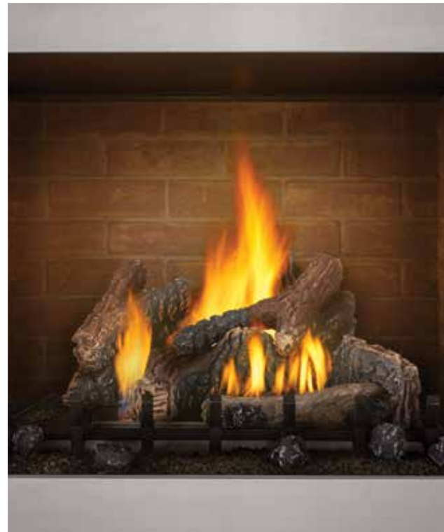
The Riverside™ 42 Clean Face shown with decorative sandstone brick panels