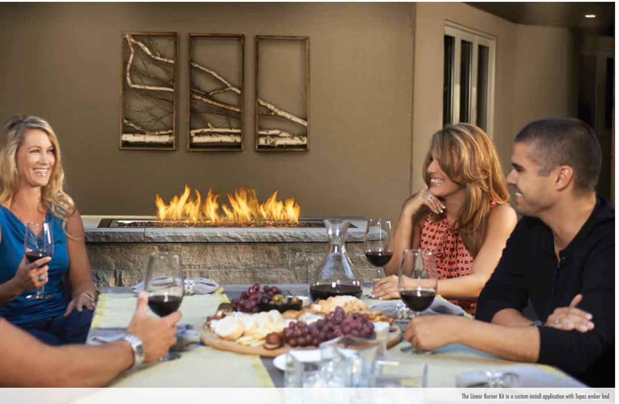
The Linear Burner Kit in a custom install application with Topaz ember bed