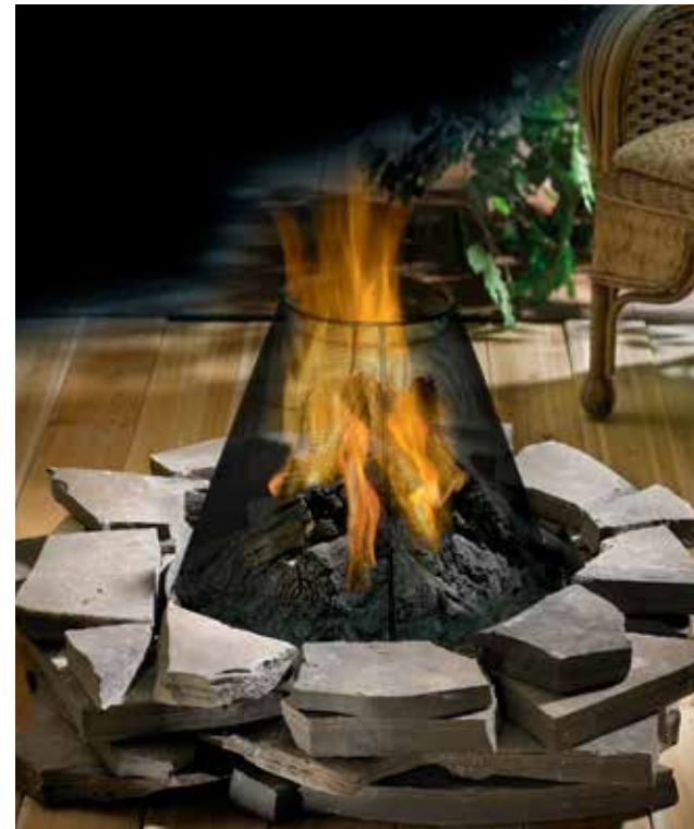
The Gas Patioflame® shown with GLOCAST® Log Set (GPF) and optional safety screen

Patioflame® Glass - GPFG 60,000 BTU's 4 ¾"h x 20" diameter Natural gas or propane