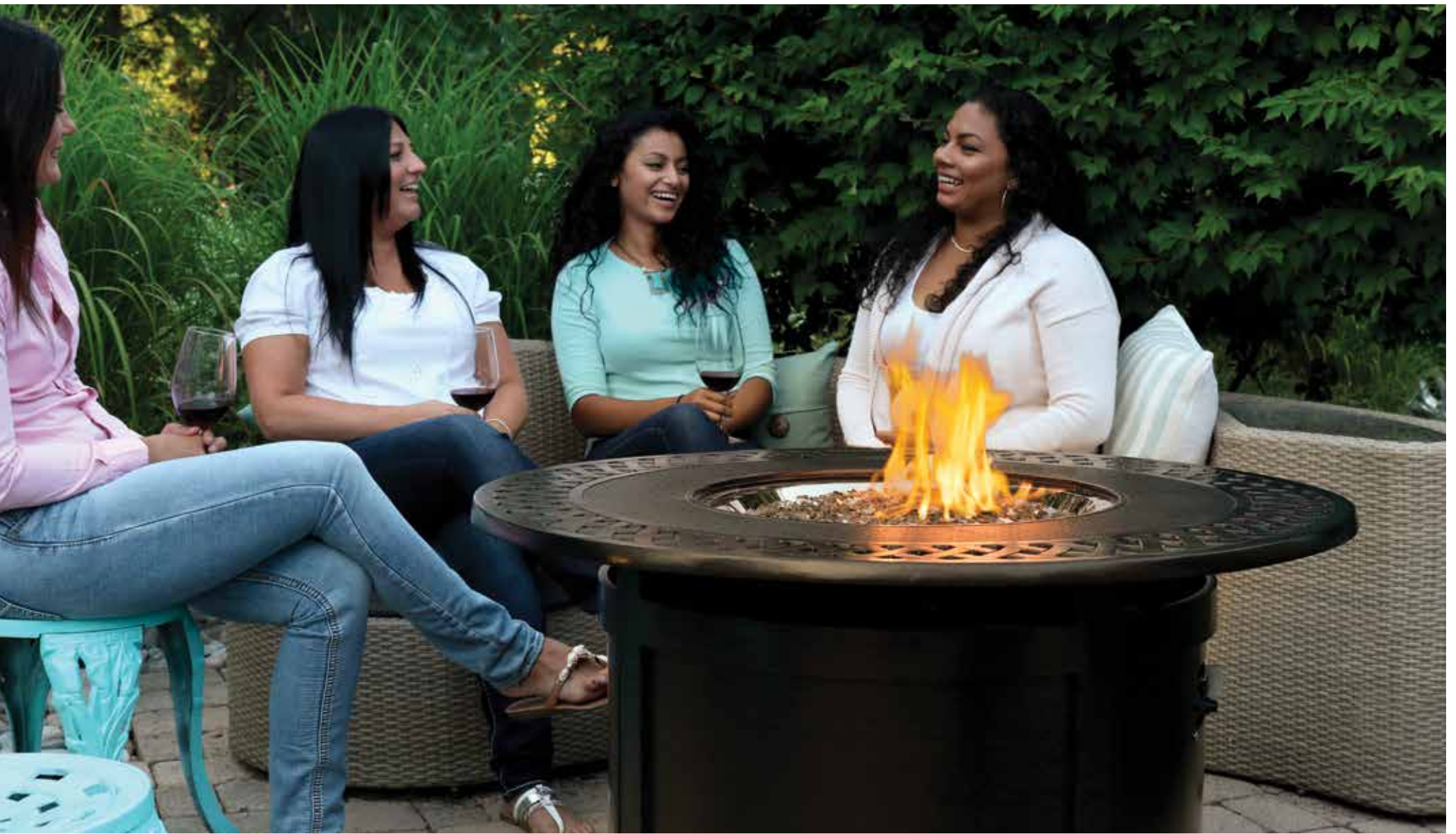
The Victorian Round Patioflame® Table