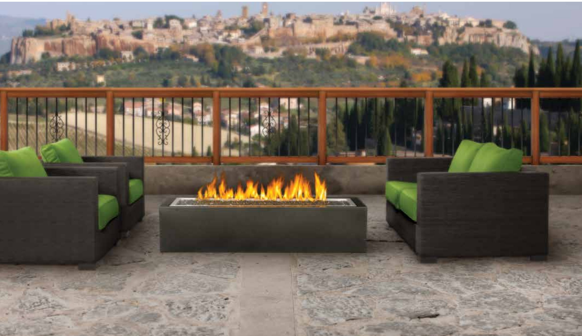
The Linear Patioflame® shown with standard Topaz CRYSTALINE® ember bed