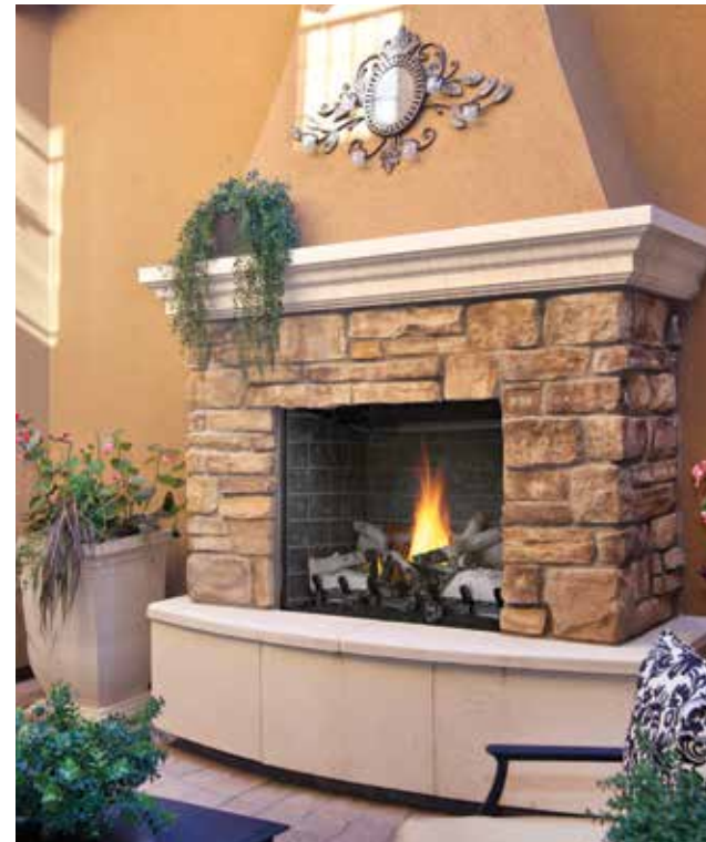
The Riverside™ 36 shown with Westminster Grey decorative brick panels.