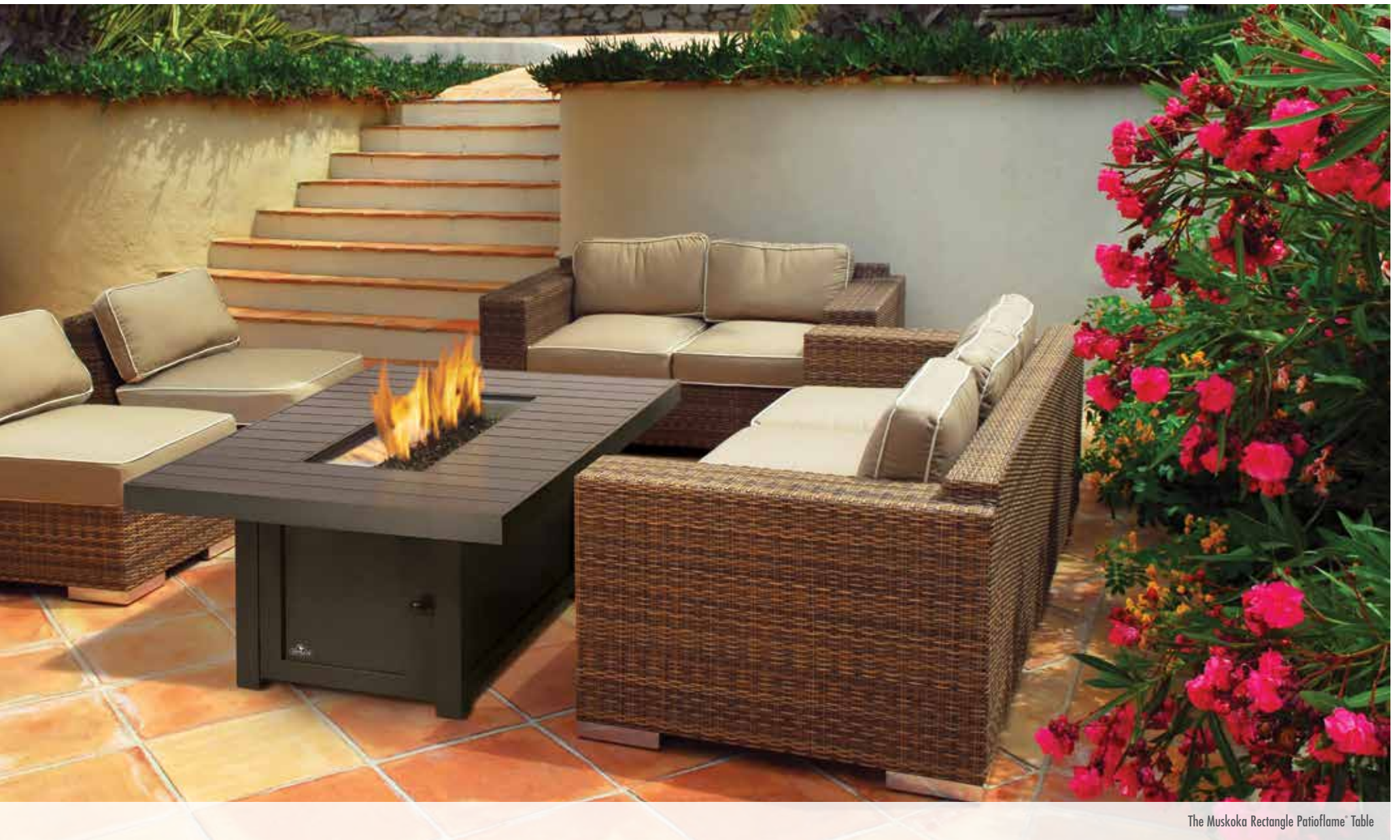
The Muskoka Rectangle Patioflame® Table