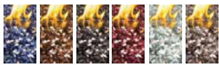
Optional Glass Media Kits Blue, Amber, Black, Red, Clear and Topaz (included)