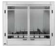
Stainless Steel Traditional Door Kit (optional)