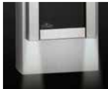
Upper/Lower Accent Lights Four Lights Included (optional)