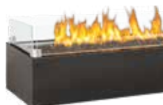
Glass Wind Deflector (optional)