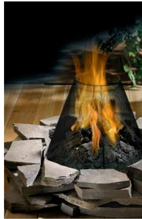
The Gas Patioflame® shown with GLOCAST® Log Set (GPF) and op

Patioflame® Glass - GPFG 60,000 BTU's 4 ¾"h x 20" diameter Natural gas or propane