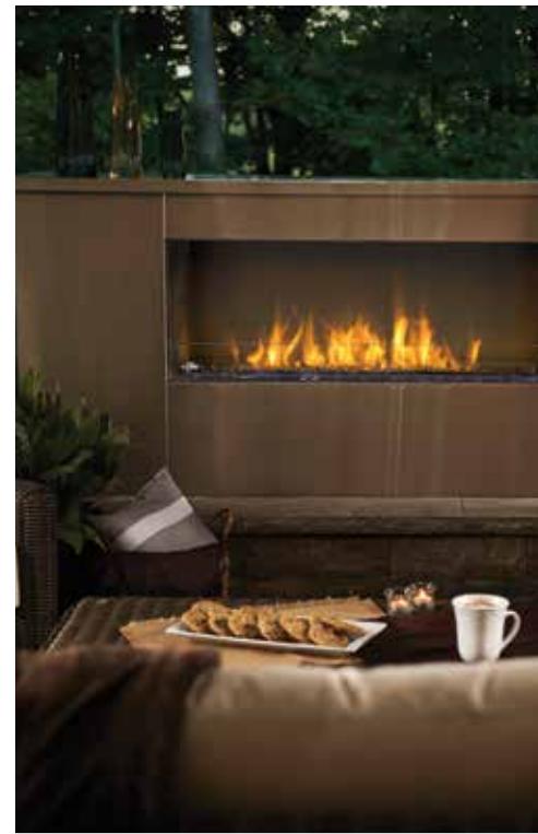
The Galaxy™ shown in a custom built-in stainless steel cabinet

Galaxy™ See-Thru - GSS48ST 55,000 BTU's 16 1/2"h x 47 1/2"w x 21 1/8"d Natural gas or propane