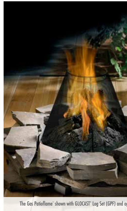
The Gas Patioflame® shown with GLOCAST® Log Set (GPF) and op

Patioflame® Glass - GPFG 60,000 BTU's 4 ¾"h x 20" diameter Natural gas or propane