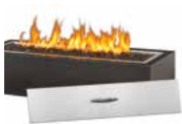
Brushed Stainless Steel Cover* and Hammertone Pewter Cabinet (included)