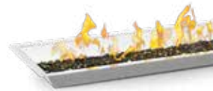
Rectangle Burner Kit