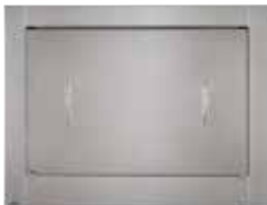
Seasonal Protective Cover (Optional)