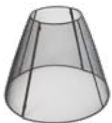
Safety Screen (optional)