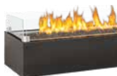
Glass Wind Deflector (optional)

* Cover is not for use with optional rock media kits.