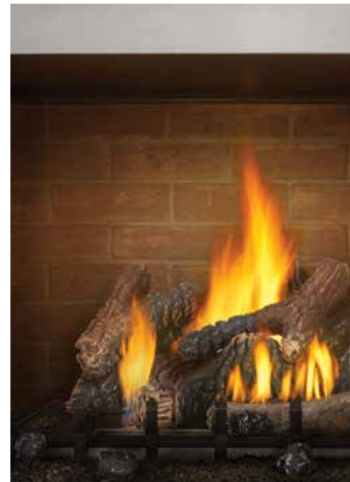
The Riverside™ 42 Clean Face shown with decorative sand