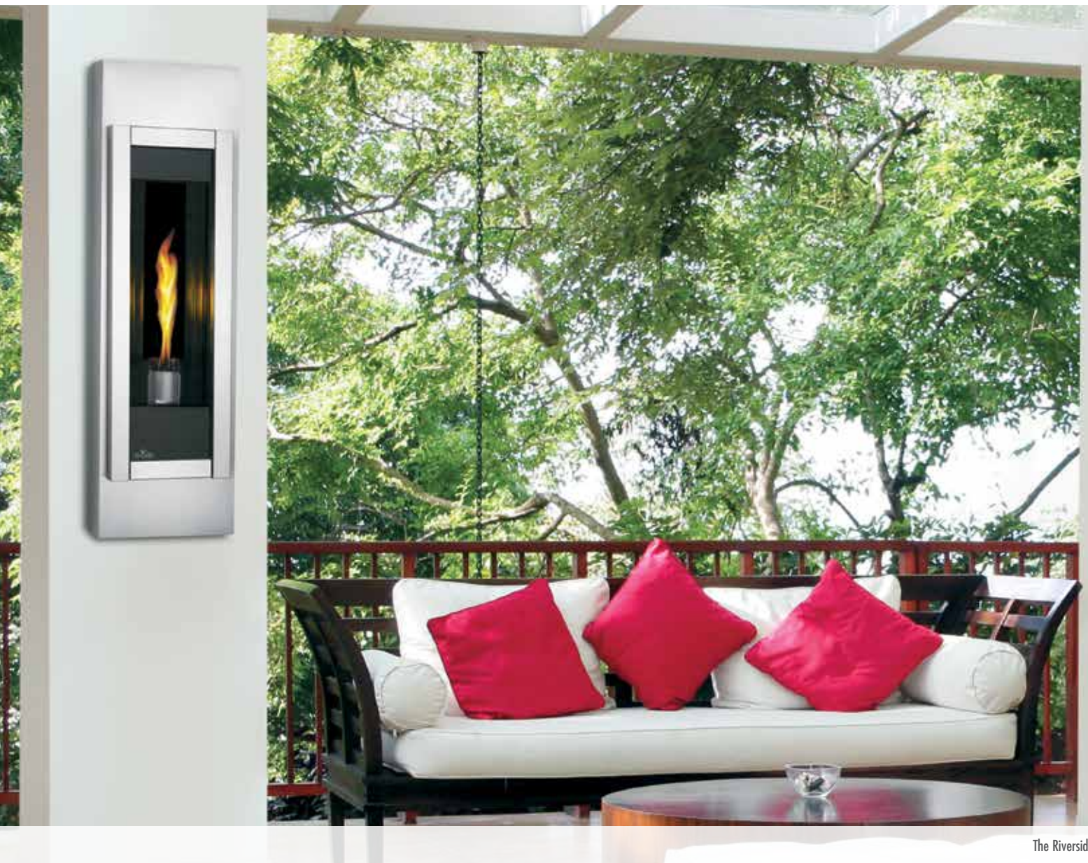
The Riverside Tor