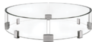
Windscreen Round | GPFC-WNDSCRN