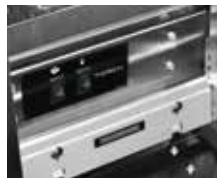
Convenient On/Off and Accent Light Switches (included)