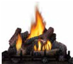
PHAZER® log set and embers (Included)