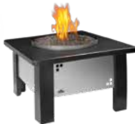
Table and Black Granite Top (optional)