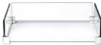
Wind Screen Square | GPFSE-WNDSCRN