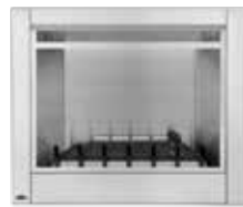
Stainless Steel Safety Screen (optional)