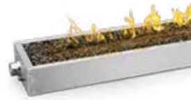
Linear Burner Kit

Consult your owner's manual for complete and up-to-date measurements and installation instructions for proper clearances to combustible materials.