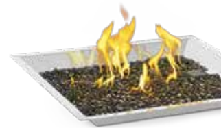
Square Burner Kit