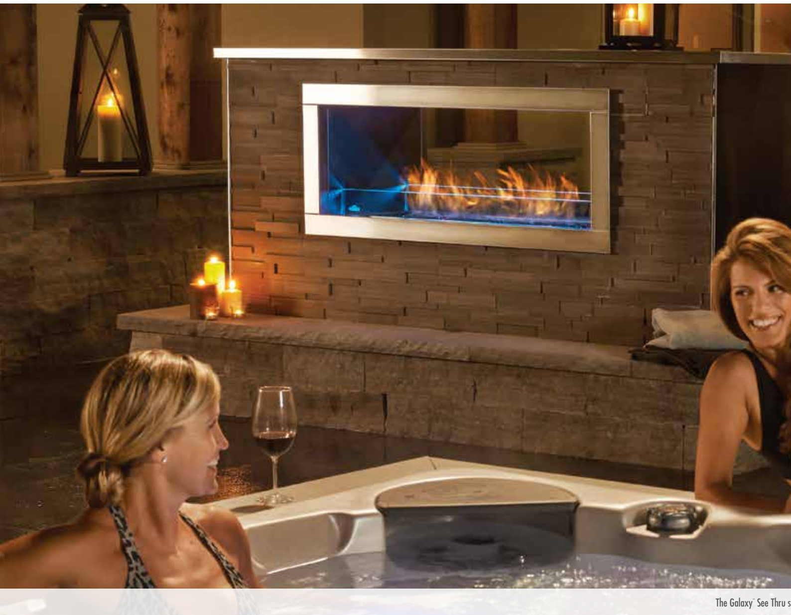
The Galaxy™ See Thru s