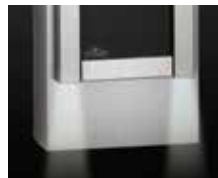
Upper/Lower Accent Lights Four Lights Included (optional)