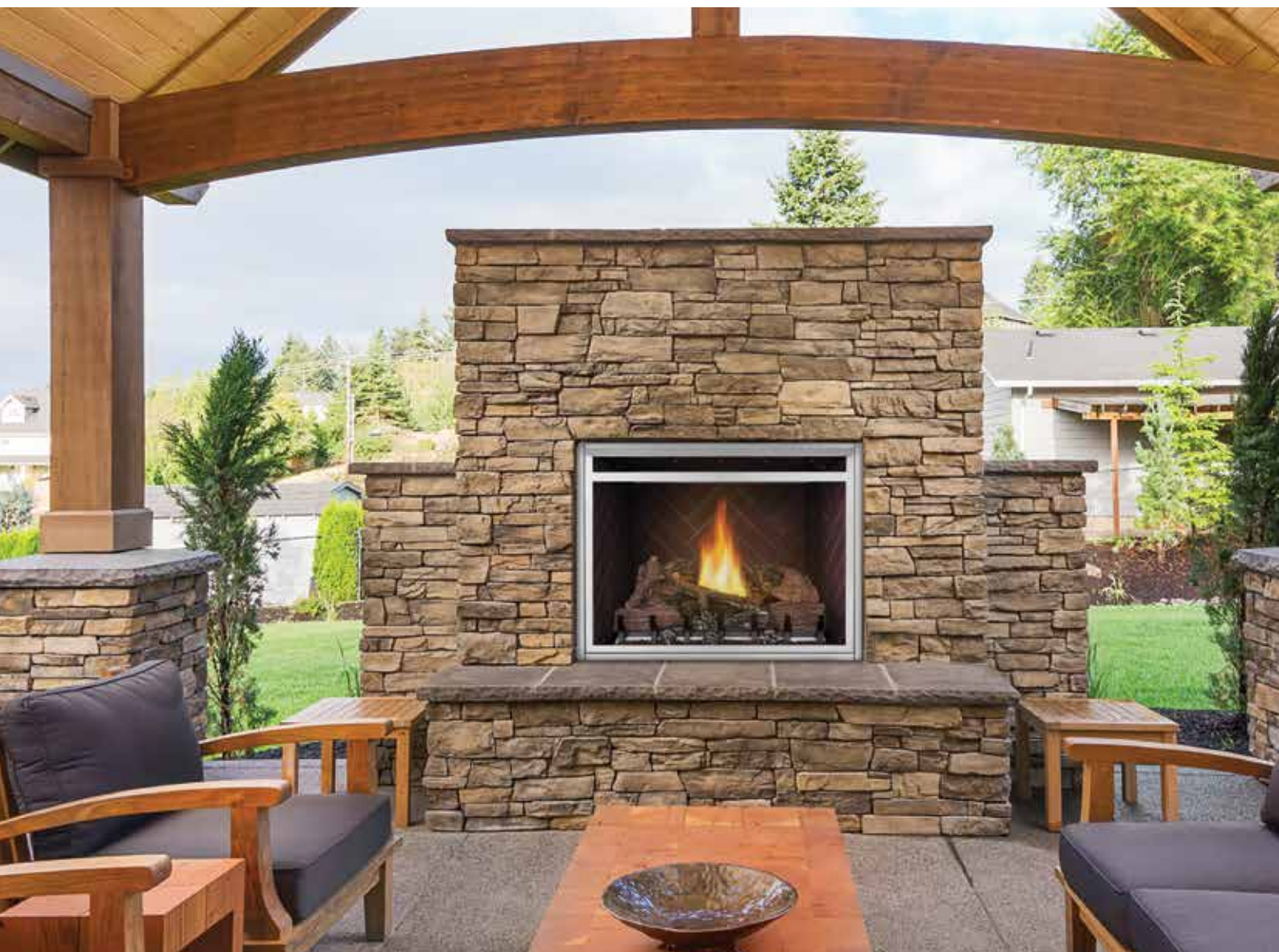
The Riverside 36 shown with stain