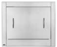
Stainless Steel Seasonal Cover (optional)