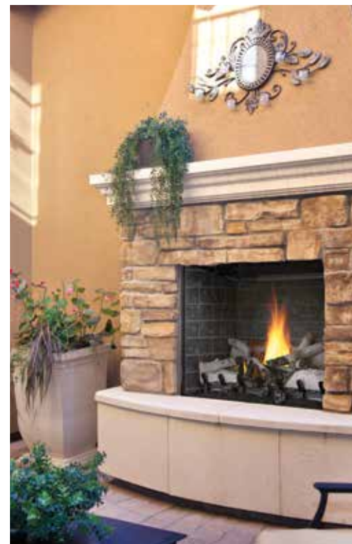
The Riverside™ 36 shown with Westminster Grey dec