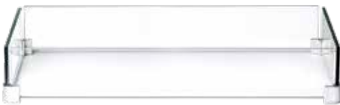
Wind Screen Rectangle | GPFRE-WNDSCRN