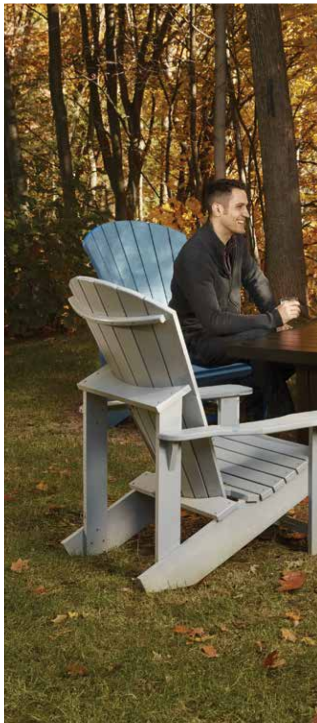
The St. Tropez Square Patioflame® Tables