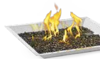
Square Burner Kit