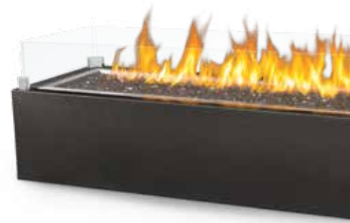
The Linear Patioflame® shown with standard Topaz CRYSTALINE™ ember bed

Linear Patioflame® - GPFL48MHP 60,000 BTU's 11 7/8" h x 51 7/8" w x 17 7/8" d Natural gas or propane