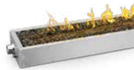
Linear Burner Kit

Consult your owner's manual for complete and up-to-date measurements and installation instructions for proper clearances to combustible materials.