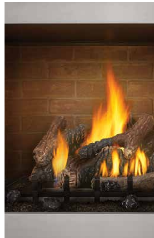
The Riverside™ 42 Clean Face shown with decorative sa