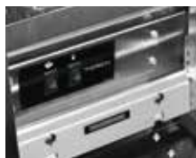
Convenient On/Off and Accent Light Switches (included)