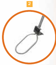
Electric Starter (Sold Separately)