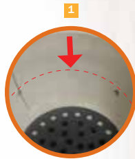
Charcoal Fill Level

Set bottom vent wide open and open lid. Measure out the amount of charcoal needed. For grilling foods fill the fire bowl with enough charcoal to just cover the air holes. Do not exceed 3.5 qt. (1.67 kg) of charcoal. For smoking foods at low temperatures for longer periods of time (1.5 hours+) you will need to add a little more charcoal, up to approximately 2" (50 mm) above the same air holes. Use lump charcoal for best results.