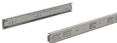
BALL SLIDES 290-0282