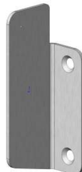
SIDE TABLE BRACKET LEFT 100-2253