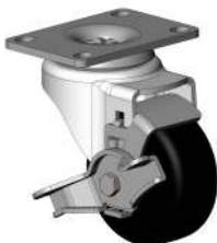
3 IN CASTER WITH LOCK 290-0080