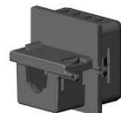
STRAIN RELIEF 210-0269