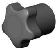
HAND KNOB 290-0441