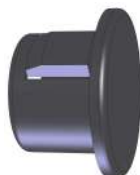
HOLE PLUG 200-0041