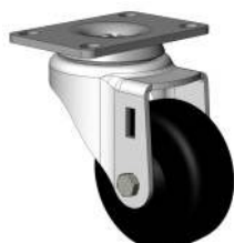
3 IN CASTER WITHOUT LOCK 290-0079