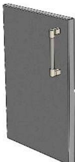
LEFT DOOR 510-0709