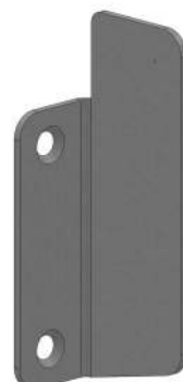
SIDE TABLE BRACKET RIGHT 100-2254