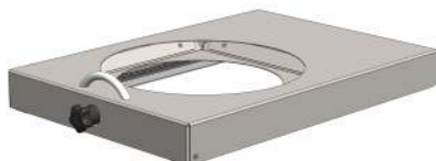
GAS TANK SLIDEOUT BASE 510-0624