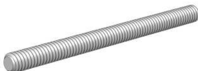
THREADED ROD 200-0366