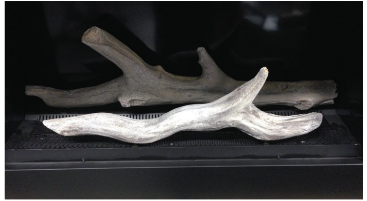
Figure 3– Front Log Placement