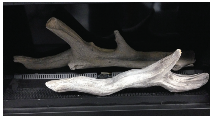
Figure 4 – Alternative Front Log Placement

Hearth & Home Technologies 7571 215th Street West, Lakeville, MN 55044 www.hearthnhome.com