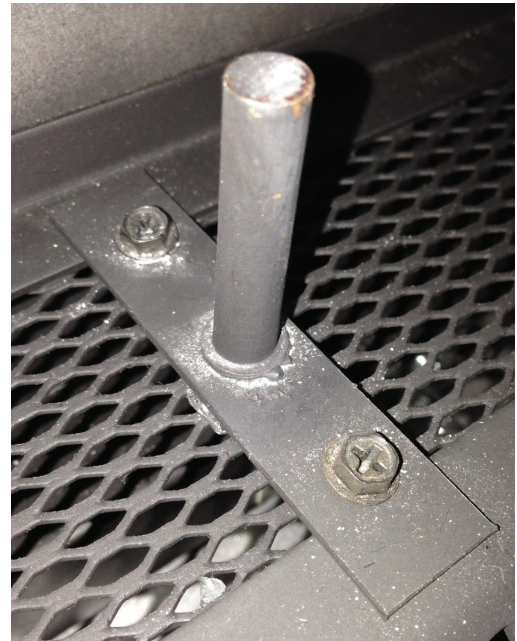
Figure 1 – Log Pin Assembly

NOTE: Prior to installing the log set, you must first install the pin brackets on the burner. The air deflection glass and fireglass should only be installed after the pin brackets are in place. The air deflection glass should be installed prior to placing and fireglass on the burner. The logs must then be placed in the unit after the fireglass and air deflection glass. If the optional logs are added after the air deflection glass and fireglass are in use, move the fireglass away from the areas in Figure 1 and install the support brackets, then arrange fireglass evenly across burner again.