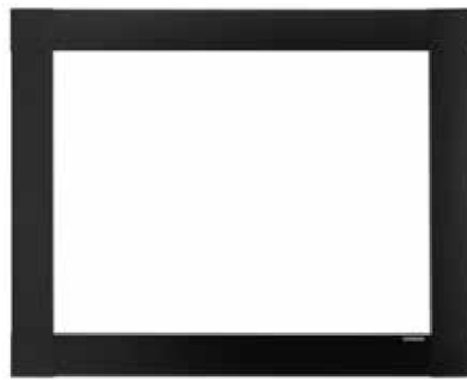
Contemporary Front for Attribute