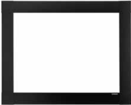
Contemporary Front for Attribute