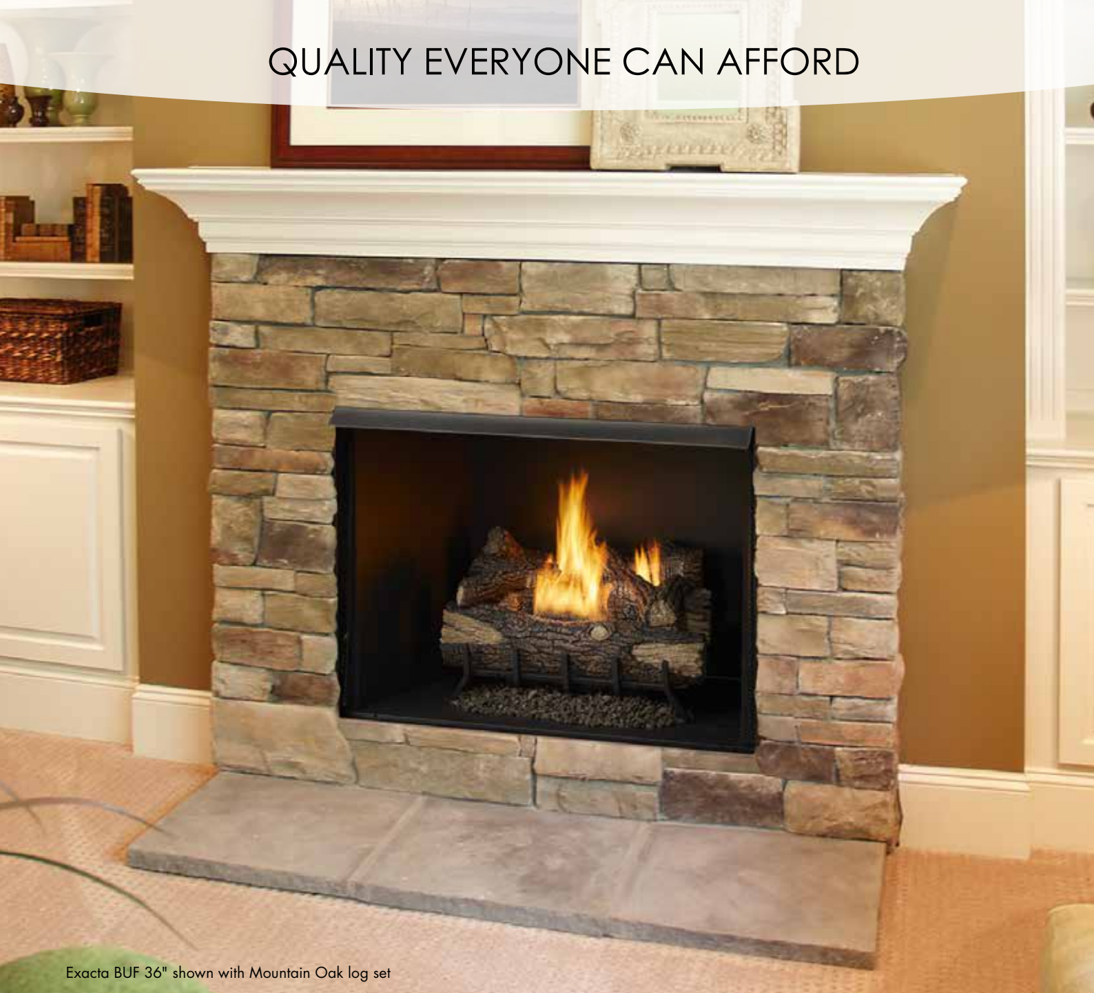
Exacta BUF 36" shown with Mountain Oak log set