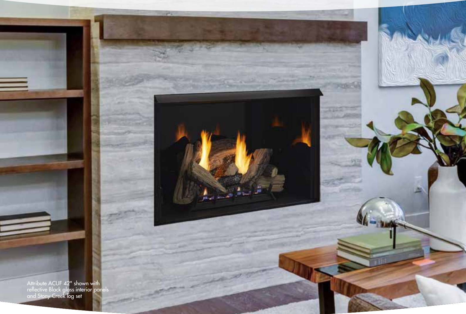
Attribute ACUF 42" shown with reflective Black glass interior panels and Stony Creek log set