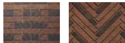
Multitoneal Brown Traditional & Herringbone