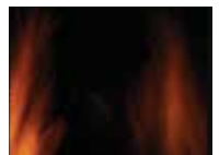
Reflective Black Glass

Note: Multitoneal and Black Glass interior panels available for single-sided units only.