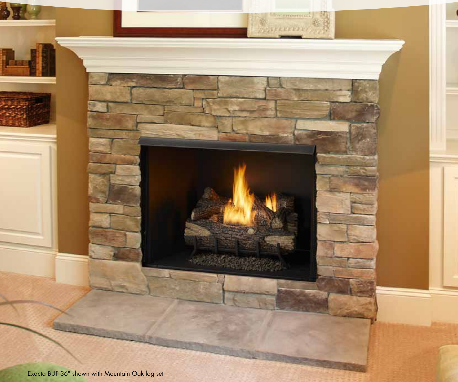
Exacta BUF 36" shown with Mountain Oak log set