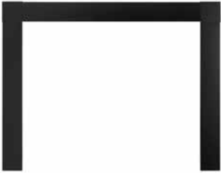
Contemporary Front for Lo-Rider