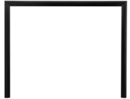
Trim Kit for Lo-Rider and Attribute