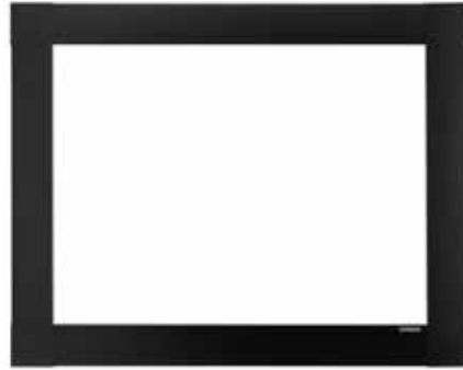
Contemporary Front for Attribute