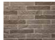
Multitoneal Gray Traditional