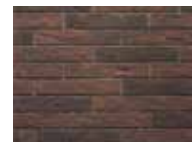
Multitoneal Brown Traditional