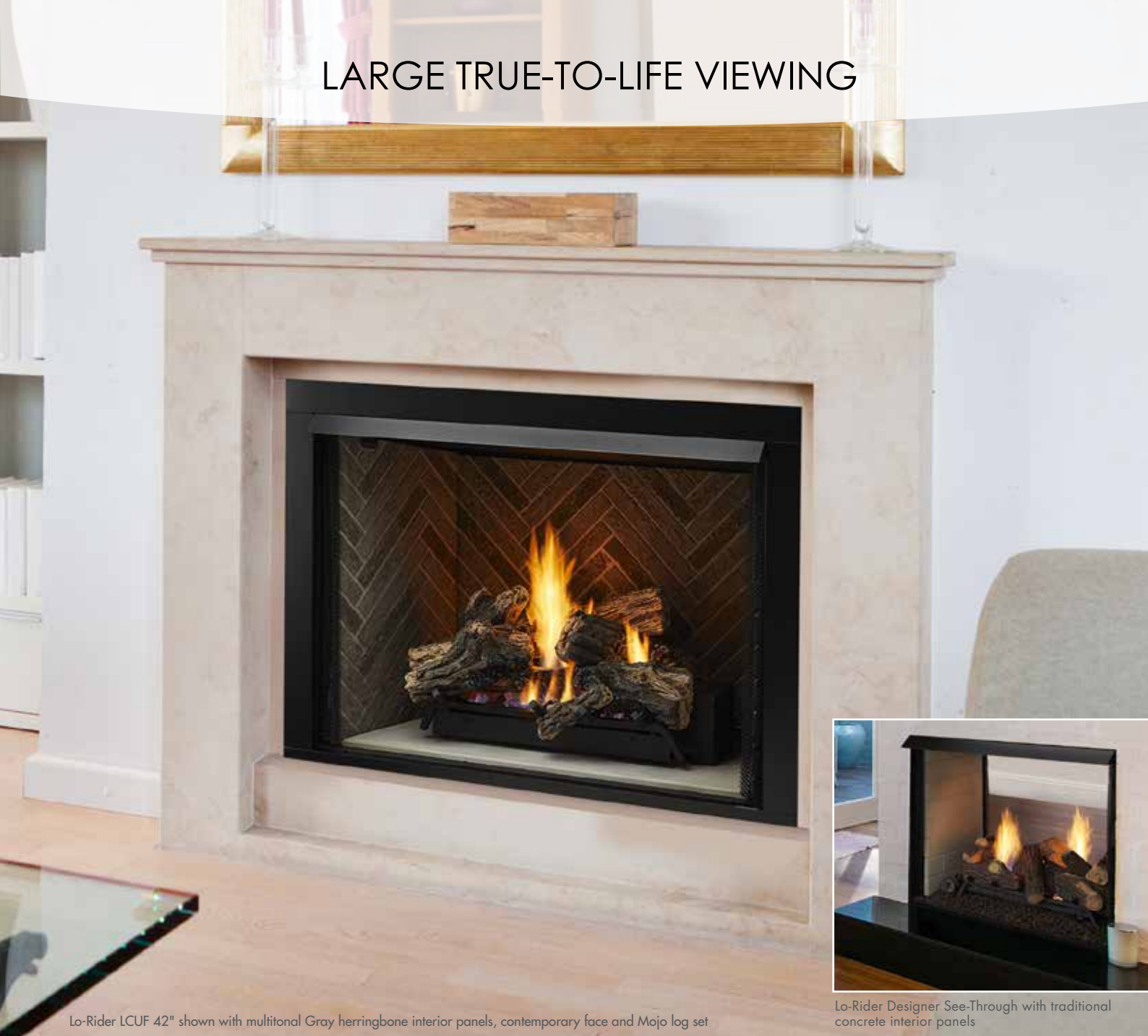
Lo-Rider LCUF 42" shown with multitoneal Gray herringbone interior panels, contemporary face and Mojo log set