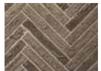
Multitoneal Gray Herringbone