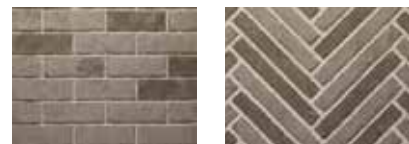
Multitoneal Gray Traditional & Herringbone