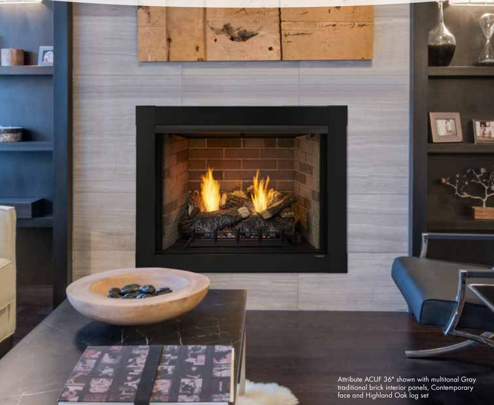
Attribute ACUF 36" shown with multitoneal Gray traditional brick interior panels, Contemporary face and Highland Oak log set