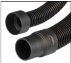
Inlet accepts 1 1/4" and 2 1/2" diameter hoses