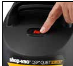
Convenient on/off switch

All vacs backed by a three year warranty