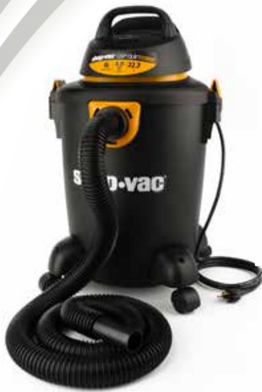
5983000 6 U.S. Gallons*, 22.7 Liters* 3.0 Peak HP†

These wet/dry vacs offer the greatest range of quiet power. From 3.0 to 6.5 peak horsepower†, the Quiet Deluxe series offers the maximum power you need for the toughest messes... wet or dry.