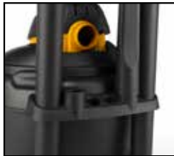
Convenient tool storage (not standard on all models)