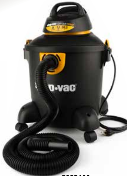
5983100 8 U.S. Gallons*, 30.3 Liters* 3.5 Peak HP†