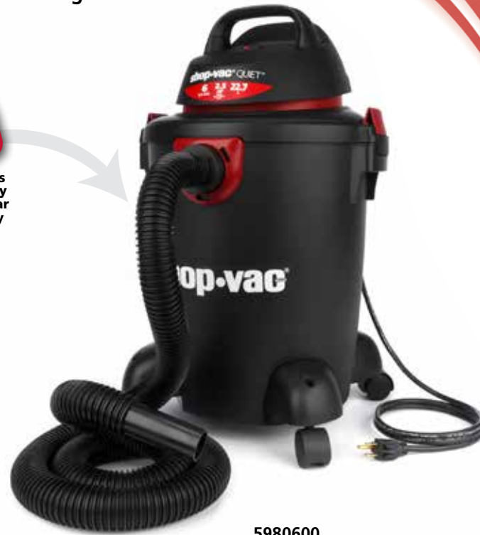
5980600 6 U.S. Gallons*, 22.7 Liters* 2.5 Peak HP†