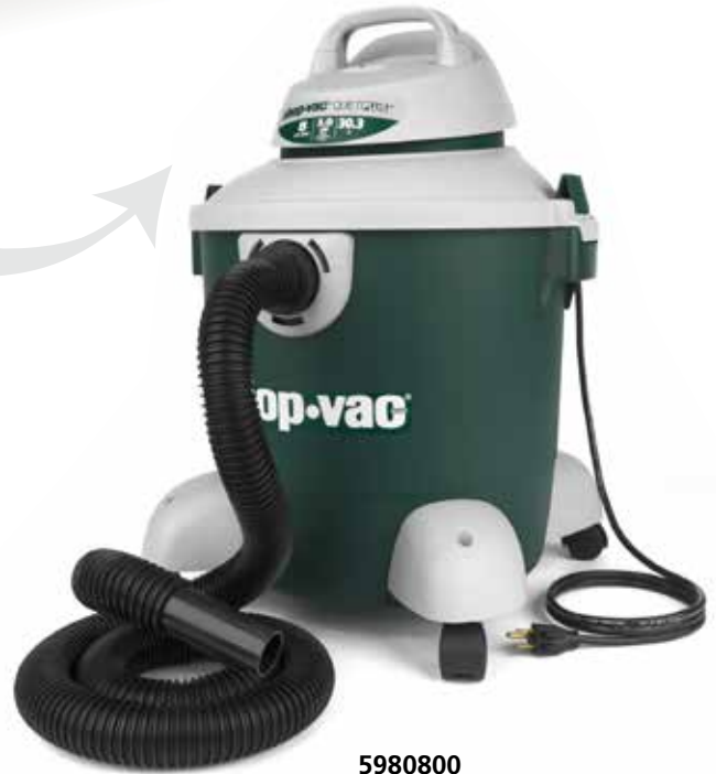
5980800 8 U.S. Gallons*, 30.3 Liters* 3.0 Peak HP†