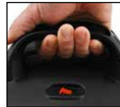
Built in top carry handle