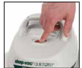
Convenient on/off switch