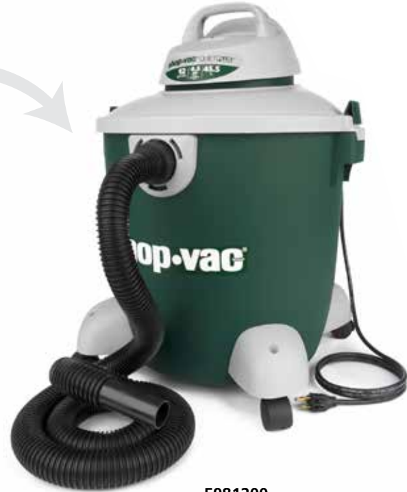
5981200 12 U.S. Gallons*, 45.5 Liters* 4.5 Peak HP†