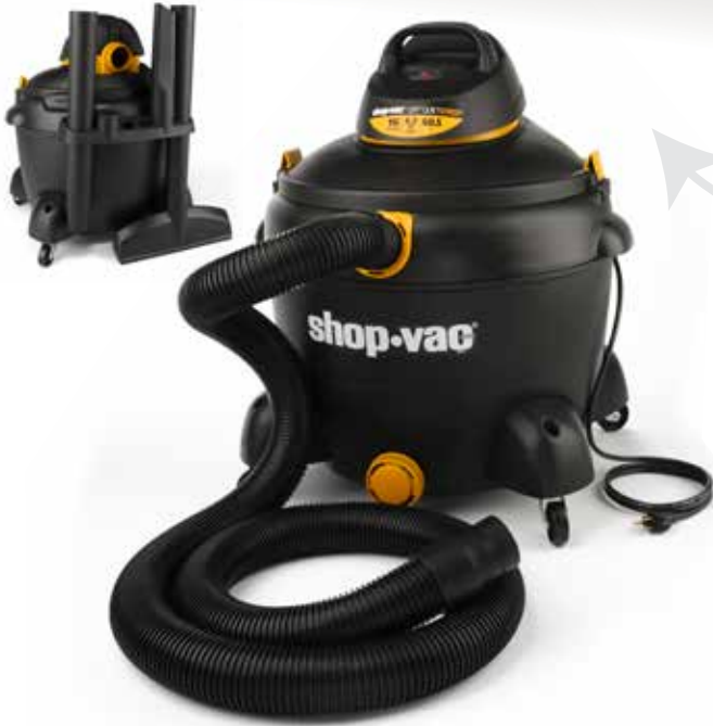
5983300 16 U.S. Gallons*, 60.5 Liters* 6.5 Peak HP†