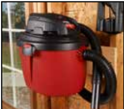
Convenient wall mounting bracket