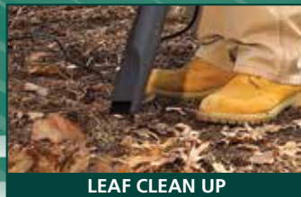
LEAF CLEAN UP