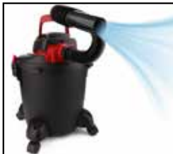
Powerful rear blower