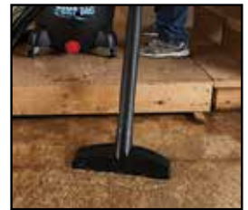
PICK IT UP