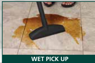
WET PICK UP