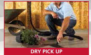
DRY PICK UP