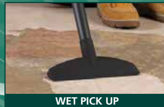
WET PICK UP

This Blower Vac gives you a wet/dry vacuum that can also be converted into a handheld, detachable blower.