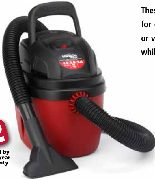
2030100 1.5 U.S. Gallons*, 5.6 Liters* 2.0 Peak HP†