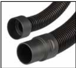
Inlet accepts 1 1/4" and 2 1/2" diameter hoses