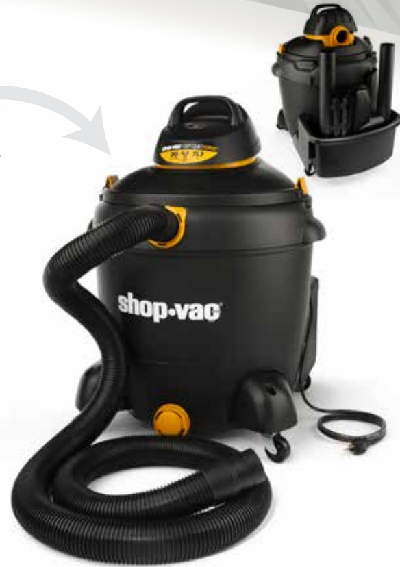
5983400 20 U.S. Gallons*, 75.7 Liters* 6.5 Peak HP†

Both vacs backed by a three year warranty