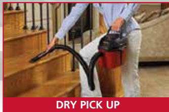
DRY PICK UP