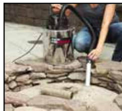
Outdoor fire pits