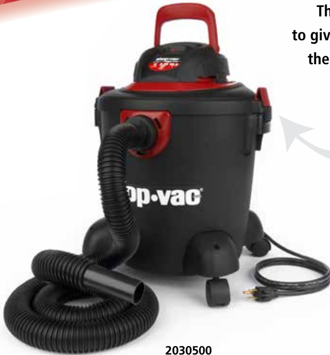
2030500 5 U.S. Gallons*, 18.9 Liters* 2.25 Peak HP†

The economical choice to give you the power to take the work out of cleaning.