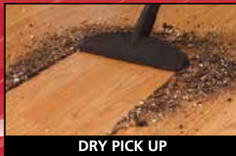
DRY PICK UP

The economical choice to give you the power to take the work out of cleaning.