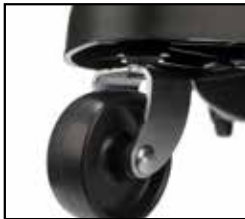
Heavy duty casters