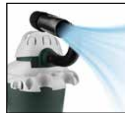
Powerful rear blower