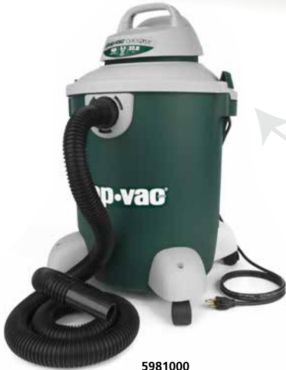
5981000 10 U.S. Gallons*, 37.8 Liters* 3.5 Peak HP†