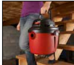
Lightweight and portable