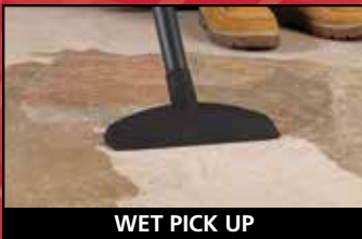
WET PICK UP