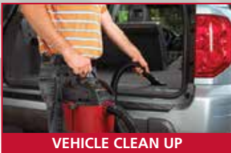
VEHICLE CLEAN UP