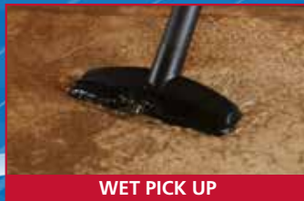
WET PICK UP