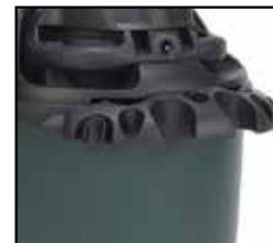
On board tool storage keeps you organized