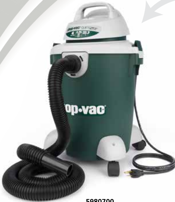
5980700 6 U.S. Gallons*, 22.7 Liters* 2.75 Peak HP†

These wet/dry vacs offer an even greater range of quiet power. With motors ranging from 2.75 to 4.5 peak horsepower†, we can equip you with the power you need, for any mess... wet or dry.