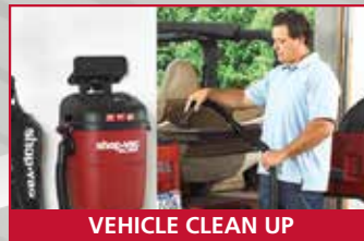
VEHICLE CLEAN UP