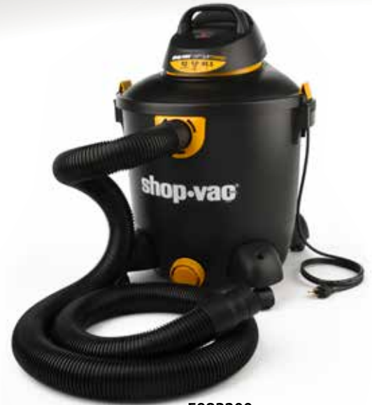
5983200 12 U.S. Gallons*, 45.5 Liters* 5.0 Peak HP†