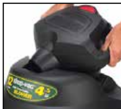
Detachable blower, quick and easy

Accessories: 7' (2.1 m) x 1 1 / 4 " (3.2 cm) Lock-On® hose, (3) 1 1 / 4 " (3.2 cm) extension wands, 10" (25.4 cm) wet/dry nozzle, (1) 2 1 / 2 " (6.4 cm) extension wand, concentrator nozzle, blower nozzle, tool holder, foam sleeve and ProLong® cartridge filter.