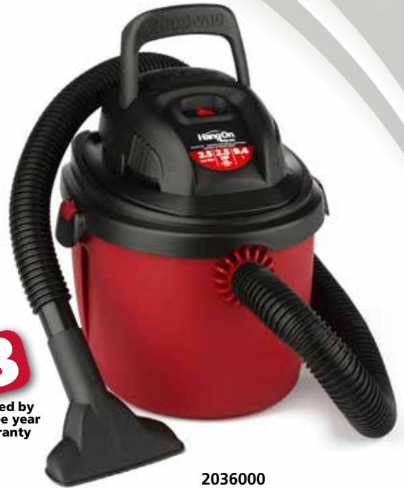
2036000 2.5 U.S. Gallons*, 9.4 Liters* 2.5 Peak HP†