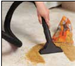
Quick kitchen spills