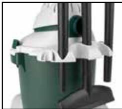
On board tool storage keeps you organized