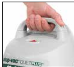
Built in top carry handle