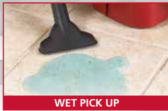
WET PICK UP