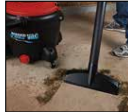
Dry pick up

5821600 16 U.S. Gallons*, 60.5 Liters* 6.0 Peak HP†