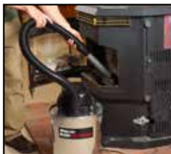
Cold furnace ashes