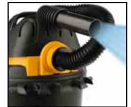
Powerful rear blower