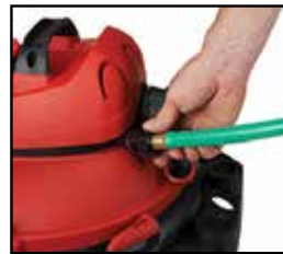
HOOK IT UP