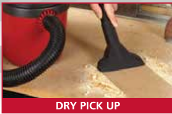
DRY PICK UP