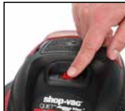
Convenient on/off switch