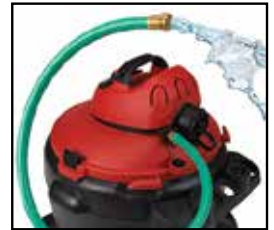
PUMP IT OUT