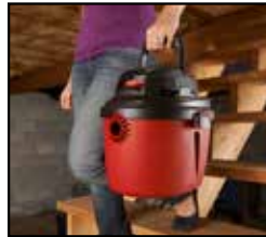
Lightweight and portable