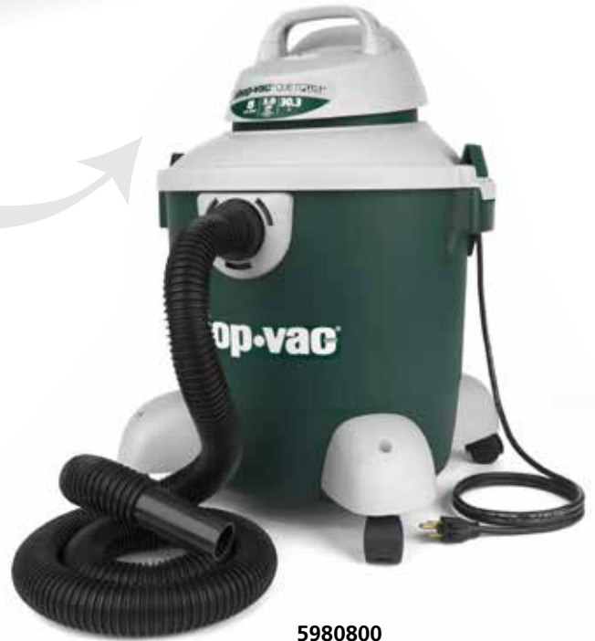
5980800 8 U.S. Gallons*, 30.3 Liters* 3.0 Peak HP†