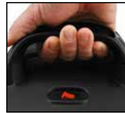
Built in top carry handle