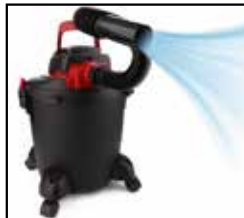
Powerful rear blower