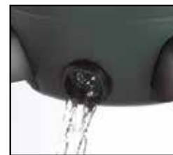
Extra large tank drain