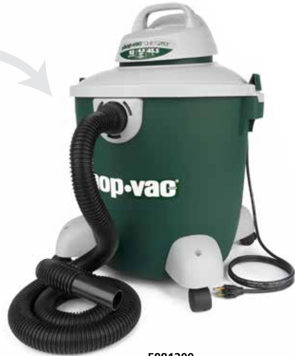
5981200 12 U.S. Gallons*, 45.5 Liters* 4.5 Peak HP†