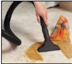
Quick kitchen spills