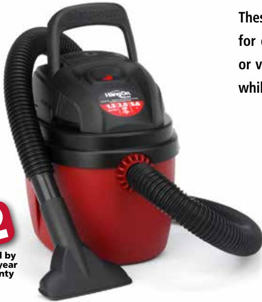
2030100 1.5 U.S. Gallons*, 5.6 Liters* 2.0 Peak HP†