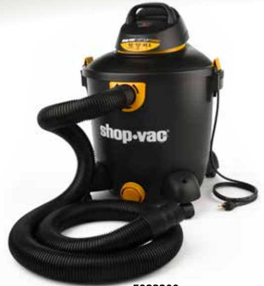
5983200 12 U.S. Gallons*, 45.5 Liters* 5.0 Peak HP†