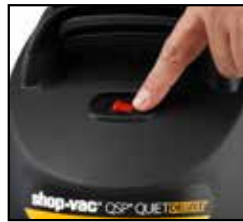
Convenient on/off switch

All vacs backed by a three year warranty