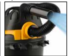
Powerful rear blower