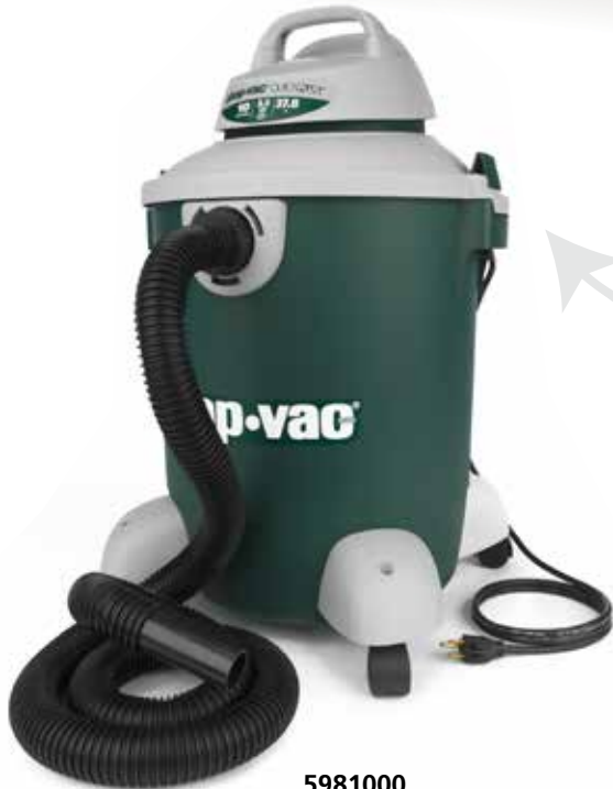
5981000 10 U.S. Gallons*, 37.8 Liters* 3.5 Peak HP†