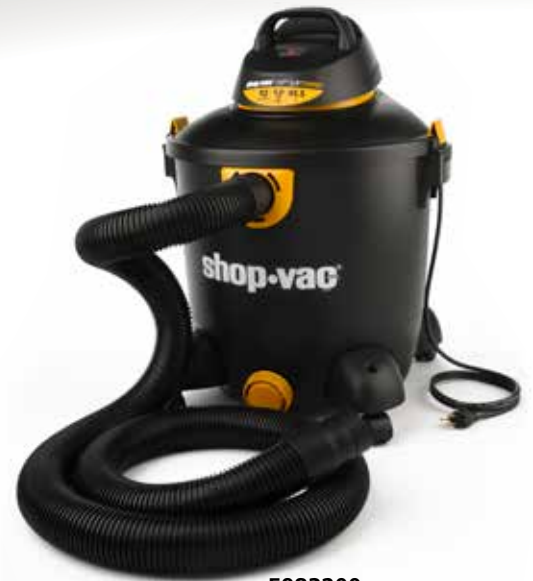
5983200 12 U.S. Gallons*, 45.5 Liters* 5.0 Peak HP†