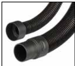
Inlet accepts 1¼" and 2½" diameter hoses