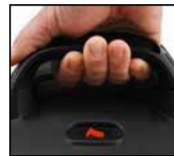
Built in top carry handle