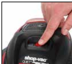
Convenient on/off switch