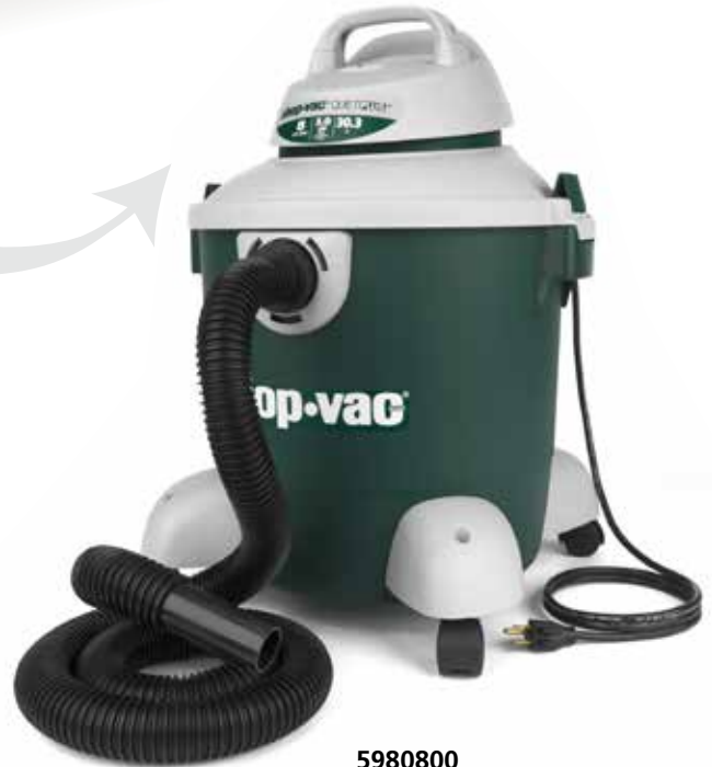
5980800 8 U.S. Gallons*, 30.3 Liters* 3.0 Peak HP†