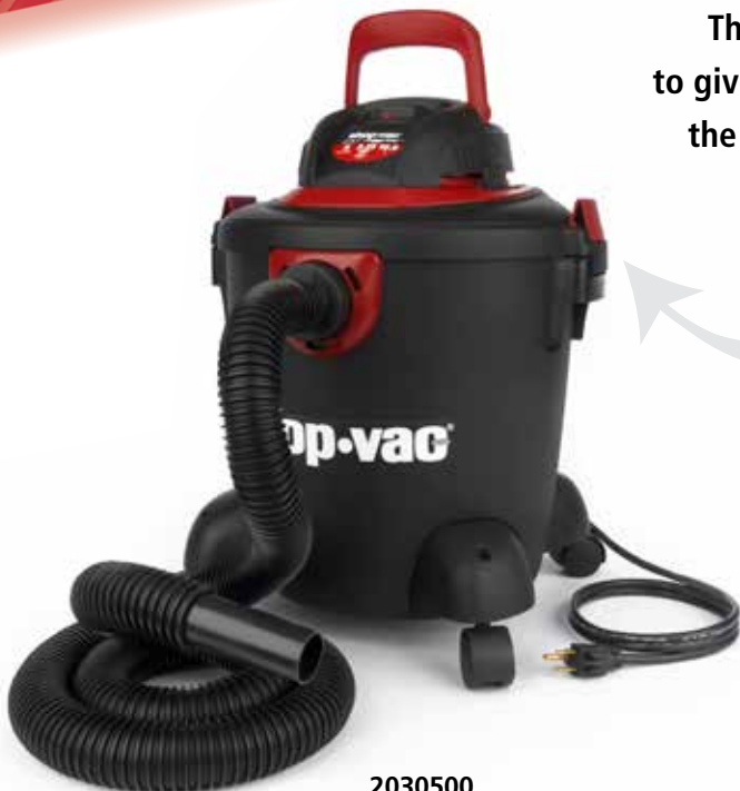
2030500 5 U.S. Gallons*, 18.9 Liters* 2.25 Peak HP†

The economical choice to give you the power to take the work out of cleaning.