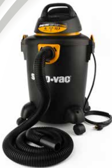
5983000 6 U.S. Gallons*, 22.7 Liters* 3.0 Peak HP†

These wet/dry vacs offer the greatest range of quiet power. From 3.0 to 6.5 peak horsepower†, the Quiet Deluxe series offers the maximum power you need for the toughest messes... wet or dry.