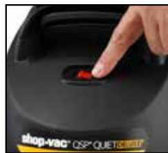
Convenient on/off switch

All vacs backed by a three year warranty