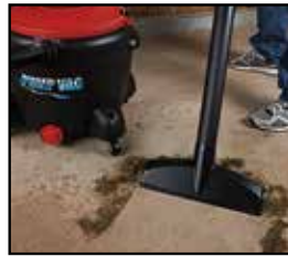
Dry pick up

5821600 16 U.S. Gallons*, 60.5 Liters* 6.0 Peak HP†