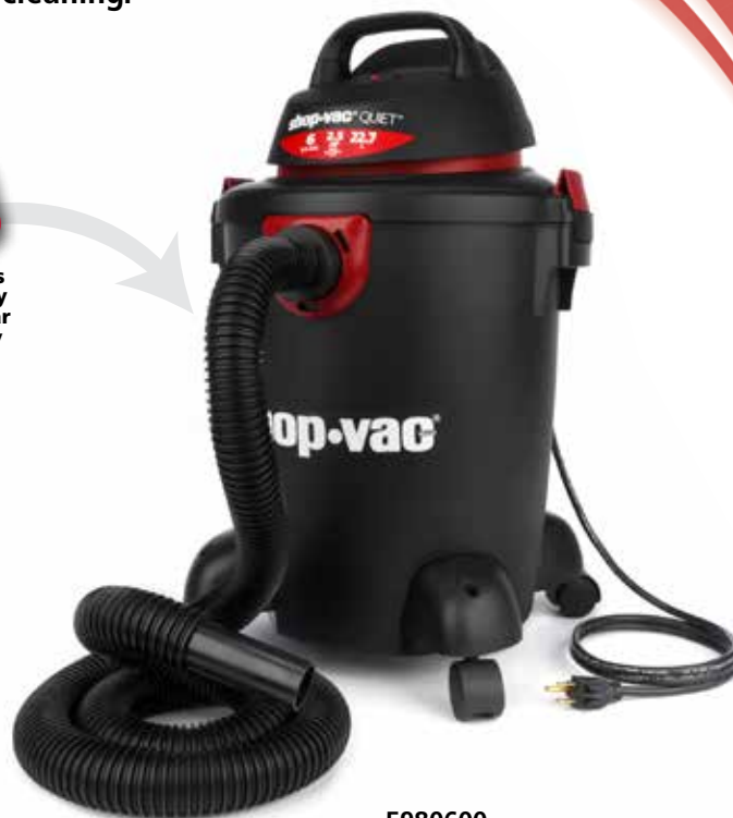
5980600 6 U.S. Gallons*, 22.7 Liters* 2.5 Peak HP†