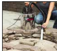
Outdoor fire pits