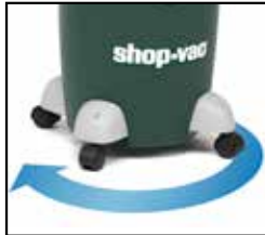
360° Easy glide caster system