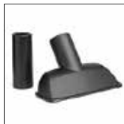
91967 - 6" Nozzle Ideal for cleaning vehicle interiors, workshop benches and more.