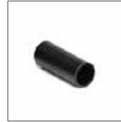
91959 - 1 1/4" to 1 1/2" Adapter Allows you to use 1 1/4" hose with a 1 1/2" accessories.