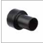
90649 - 2 1/2" to 1 1/2" Converter Allows you to use 2 1/2" accessories with a 1 1/2" hose.