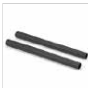
91995 - 2 - Piece Extension Wands Provides longer reach when cleaning.