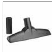
91991 - 12" Floor Nozzle Cleans wide areas for wet or dry pick up.