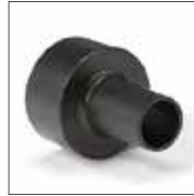
90685 - 2 1/2" to 1 1/4" Conversion Unit Allows you to use 1 1/4" accessories with a 2 1/2" hose.