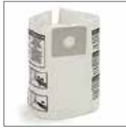
90662 (TYPE F) Filter Bags (3 pack) Fits 10-14 U.S. Gallon vacs.