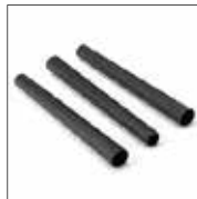
90614 - 3-Piece Extension Wands Provides longer reach when cleaning.