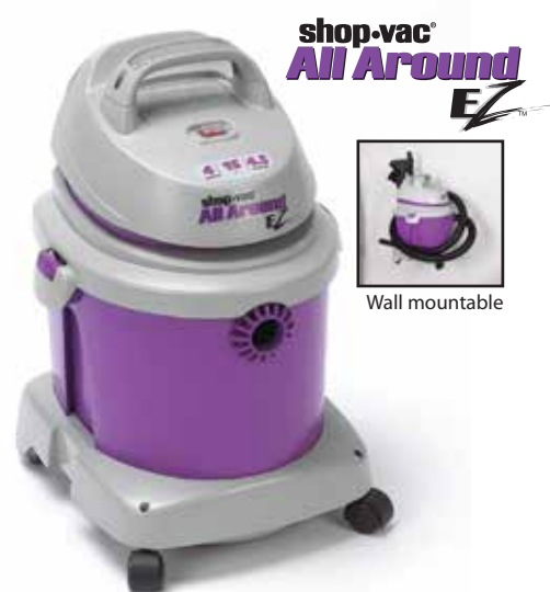
shop-vac® All Around EZ™