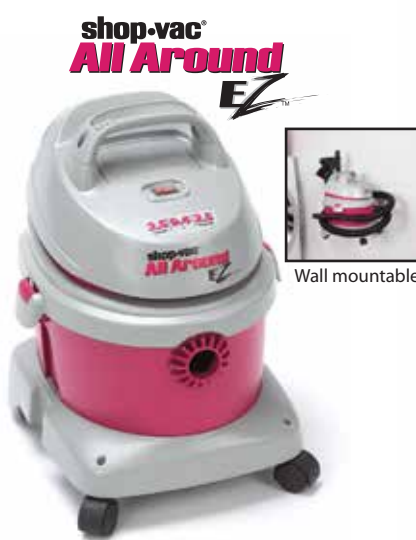
shop-vac® All Around EZ™