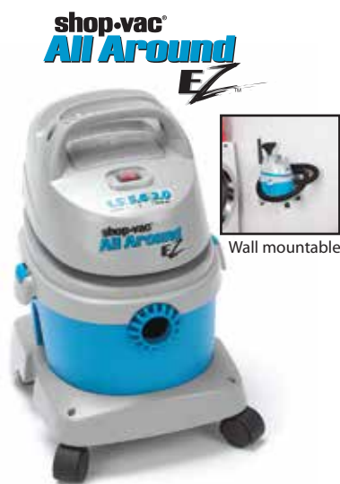
shop-vac® All Around EZ™

Cleans up carpets, vehicles, campers, upholstery, stairs, kitchens, workshops, boats and has many other uses.