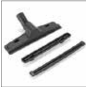
90665 - Deluxe Floor Nozzle with Squeegee Insert and Brush Insert A swivel elbow and the extra wide cleaning path makes clean up a snap.