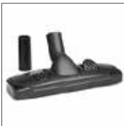
91968 - Dual Surface Nozzle For use with both carpets and floors.