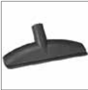
90621 - 10" Wet/Dry Nozzle Good for all purpose cleaning.