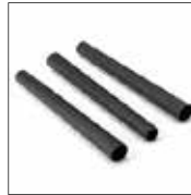
90614 - 3-Piece Extension Wands Provides longer reach when cleaning.