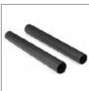
90684 - 40" Extension Wand (2 piece) Provides longer reach when cleaning.