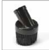
90615 - Round Brush Great for all purpose dry pick up...dirt, sawdust, furniture blinds, etc.