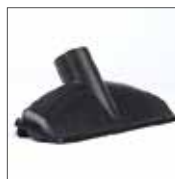
90677 - 14" Floor Nozzle Cleans wide areas with bulk dry pick up and wet pick up power.