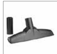
91991 - 12" Floor Nozzle Cleans wide areas for wet or dry pick up.