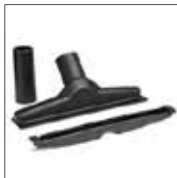
91966 - 10" Squeegee Nozzle For wet pick up.