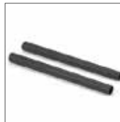
91995 - 2 - Piece Extension Wands Provides longer reach when cleaning.