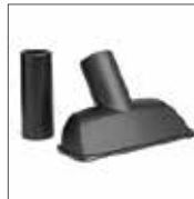
91967 - 6" Nozzle Ideal for cleaning vehicle interiors, workshop benches and more.