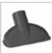
90675 - 8" Utility Nozzle Great for bulk dry pick up.