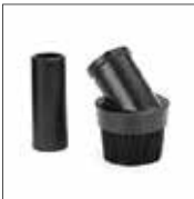
91997 - Round Brush Great for all purpose dry pick up: dirt, sawdust, furniture venetian blinds, etc.