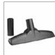
91991 - 12" Floor Nozzle Cleans wide areas for wet or dry pick up.