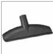
90621 - 10" Wet/Dry Nozzle Good for all purpose cleaning.