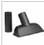
91967 - 6" Nozzle Ideal for cleaning vehicle interiors, workshop benches and more.