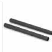
91995 - 2 - Piece Extension Wands Provides longer reach when cleaning.