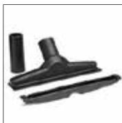
91966 - 10" Squeegee Nozzle For wet pick up.