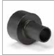
90685 - 2 1/2" to 1 1/4" Conversion Unit Allows you to use 1 1/4" accessories with a 2 1/2" hose.