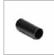
91959 - 1 1/4" to 1 1/2" Adapter Allows you to use 1 1/4" hose with a 1 1/2" accessories.