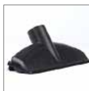
90677 - 14" Floor Nozzle Cleans wide areas with bulk dry pick up and wet pick up power.