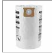
90663 (TYPE G) Filter Bags (3 pack) Fits 15-22 U.S. Gallon vacs.