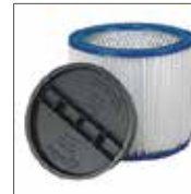
90340 (TYPE W) Large CleanStream® HEPA Cartridge Filter 99.97% efficient down to 0.3 microns. Non-stick surface makes for easy clean up and resists clogging. Fits Shop-Vac® brand wet/dry vacs 5 U.S. gallon and above, except 5 U.S. gallon portable model H87S, 6 U.S. gallon long life model P12S and HangUp®/Wall Mount vacs.