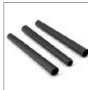
90614 - 3-Piece Extension Wands Provides longer reach when cleaning.