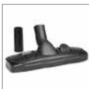
91968 - Dual Surface Nozzle For use with both carpets and floors.