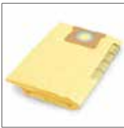
90673 (TYPE J) High Efficiency Filter Bags (2 pack) Fits 15-22 U.S. Gallon vacs.