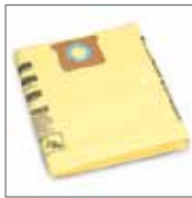
90672 (TYPE I) High Efficiency Filter Bags (2 pack) Fits 10-14 U.S. Gallon vacs.