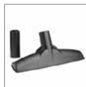
91991 - 12" Floor Nozzle Cleans wide areas for wet or dry pick up.