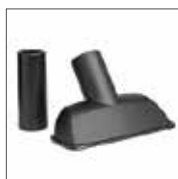
91967 - 6" Nozzle Ideal for cleaning vehicle interiors, workshop benches and more.