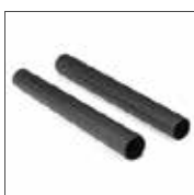
90684 - 40" Extension Wand (2 piece) Provides longer reach when cleaning.