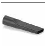
90678 - Crevice Tool Gets hard-to-reach places. Cleans radiators, vehicle interiors, etc.