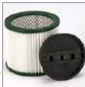
90307 (TYPE JJ) Large CleanStream® High Efficiency Cartridge Filter 95% efficient down to 0.3 microns. Non-stick surface makes for easy clean up and resists clogging. Fits Shop-Vac® brand wet/dry vacs 5 U.S. gallon and above, except 5 U.S. gallon portable model H87S, 6 U.S. gallon long life model P12S and HangUp®/ Wall Mount vacs.