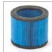
90397 (TYPE BB) Small HangUp® Ultra Web® Cartridge Filter Fits 1-4 U.S. gallon vacs, 5 U.S. gallon portable model H87S, 5 U.S. gallon HangUp®/ Wall Mount vacs and 6 U.S. gallon long life model P12S. Does not fit 1x1®, Micro®, HangOn® and HangUp® Mini.