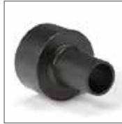
90685 - 2 1/2" to 1 1/4" Conversion Unit Allows you to use 1 1/4" accessories with a 2 1/2" hose.