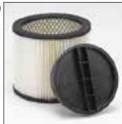
90304 (TYPE U) Large Cartridge Filter Fits Shop-Vac® brand wet/dry vacs 5 U.S. gallon and above except 5 U.S. gallon portable model H87S, 6 U.S. gallon long life model P12S and HangUp® Wall Mount vacs.