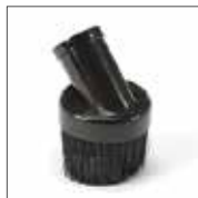
90615 - Round Brush Great for all purpose dry pick up...dirt, sawdust, furniture blinds, etc.