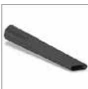
91966 - Crevice Tool Gets hard-to-reach places. Cleans radiators, vehicle interiors, etc.