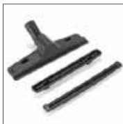
90665 - Deluxe Floor Nozzle with Squeegee Insert and Brush Insert A swivel elbow and the extra wide cleaning path makes clean up a snap.