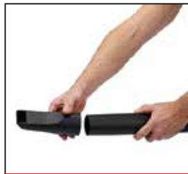
ATTACH BLOWER NOZZLE