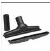
91966 - 10" Squeegee Nozzle For wet pick up.