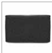
90525 (TYPE MM) Micro Foam Sleeve Fits 1 U.S. gallon Micro® vac.