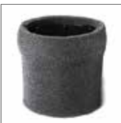
90585 (TYPE R) Large Foam Sleeve Fits Shop-Vac® brand wet/dry vacs 5 U.S. gallon and above, except 5 U.S. gallon portable model H87S, 6 U.S. gallon long life model P12S and HangUp® Wall Mount vacs.