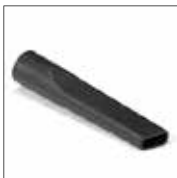
90616 - Crevice Tool Gets hard-to-reach places. Cleans radiators, vehicle interiors, etc.