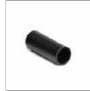
91959 - 1 1/4" to 1 1/2" Adapter Allows you to use 1 1/4" hose with a 1 1/2" accessories.