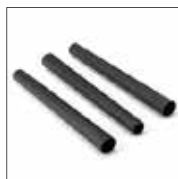
90614 - 3-Piece Extension Wands Provides longer reach when cleaning.