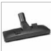
90632 - Multi Purpose Floor Nozzle Economical nozzle with settings for both carpet and bare floors.