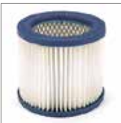
90341 (TYPE II) Small CleanStream® HEPA Cartridge Filter 99.97% efficient down to 0.3 microns. Non-stick surface makes for easy clean up and resists clogging. Fits 1-4 U.S. gallon vacs 5 U.S. gallon portable model H87S, 5 U.S. gallon HangUp®/ Wall Mount vacs and 6 U.S. gallon long life model P12S. Does not fit 1x1® Micro®, HangOn® and HangUp® Mini.