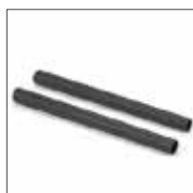
91995 - 2 - Piece Extension Wands Provides longer reach when cleaning.