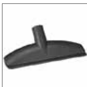
90621 - 10" Wet/Dry Nozzle Good for all purpose cleaning.