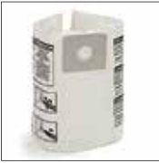
90661 (TYPE E) Filter Bags (3 pack) Fits 5-8 U.S. Gallon vacs.