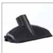
90677 - 14" Floor Nozzle Cleans wide areas with bulk dry pick up and wet pick up power.