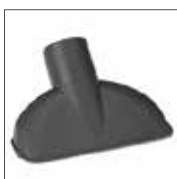
90675 - 8" Utility Nozzle Great for bulk dry pick up.