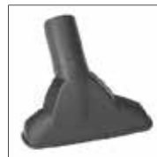
90619 - Gulper Nozzle Fast pick up tool. Ideal for vehicle interiors.