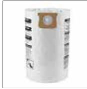
90663 (TYPE G) Filter Bags (3 pack) Fits 15-22 U.S. Gallon vacs.