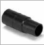
90627 - 1 1/2" to 1 1/4" Adapter Allows you to use 1 1/4" accessories with a 1 1/2" hose.