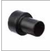
90649 - 2 1/2" to 1 1/2" Converter Allows you to use 2 1/2" accessories with a 1 1/2" hose.