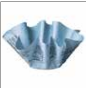
90137/90107 (TYPE T/S) Reusable Dry Filters 90137 - without mounting ring 90107 - with mounting ring