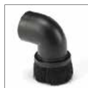
90679 - Right Angle Brush Use on blinds and all irregular surfaces.