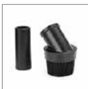
91997 - Round Brush Great for all purpose dry pick up: dirt, sawdust, furniture venetian blinds, etc.