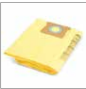
90671 (TYPE H) High Efficiency Filter Bags (2 pack) Fits 5-8 U.S. Gallon vacs.