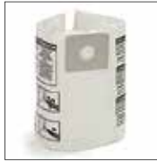
90662 (TYPE F) Filter Bags (3 pack) Fits 10-14 U.S. Gallon vacs.