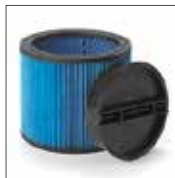
90350 (TYPE X) Large Ultra Web® Cartridge Filter Fits Shop-Vac® brand wet/dry vacs 5 U.S. gallon and above except 5 U.S. gallon portable model H87S, 6 U.S. gallon long life model P12S and HangUp® Wall Mount vacs.