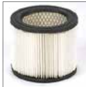
90398 (TYPE AA) Small Cartridge Filter Fits 1-4 U.S. gallon vacs, 5 U.S. gallon portable model H87S, 5 U.S. gallon HangUp®/ Wall Mount vacs and 6 U.S. gallon long life model P12S. Does not fit 1x1®, Micro®, HangOn® and HangUp® Mini.