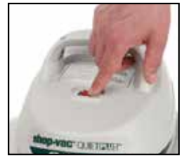
Convenient on/off switch