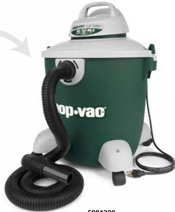
5981200 12 U.S. Gallons*, 45.5 Liters* 4.5 Peak HP†