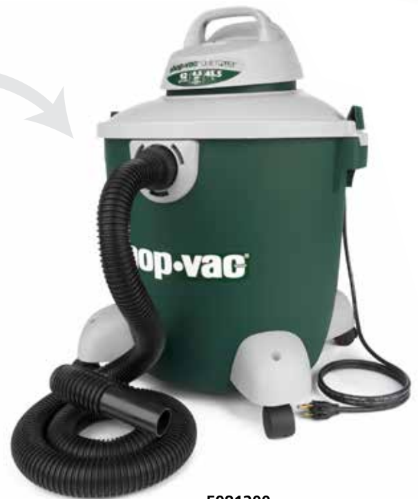
5981200 12 U.S. Gallons*, 45.5 Liters* 4.5 Peak HP†