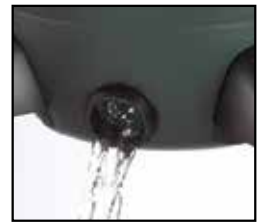
Extra large tank drain