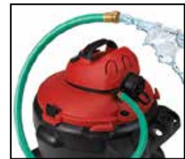
PUMP IT OUT