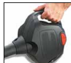
Handheld detachable blower