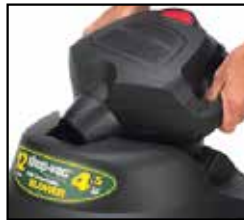
Detachable blower, quick and easy

Accessories: 7' (2.1 m) x 1 1/4" (3.2 cm) Lock-On® hose, (3) 1 1/4" (3.2 cm) extension wands, 10" (25.4 cm) wet/dry nozzle, (1) 2 1/2" (6.4 cm) extension wand, concentrator nozzle, blower nozzle, tool holder, foam sleeve and ProLong® cartridge filter.