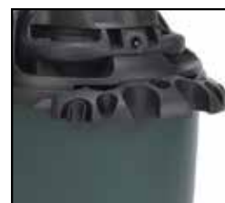
On board tool storage keeps you organized