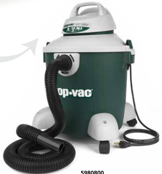
5980800 8 U.S. Gallons*, 30.3 Liters* 3.0 Peak HP †