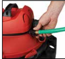
HOOK IT UP