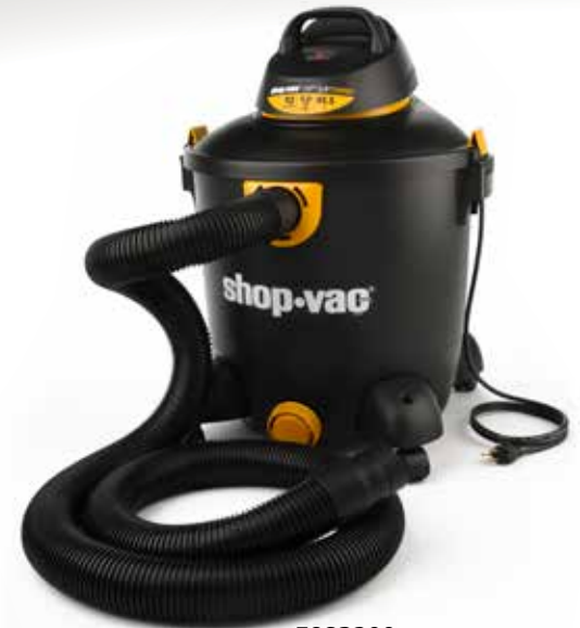
5983200 12 U.S. Gallons*, 45.5 Liters* 5.0 Peak HP†