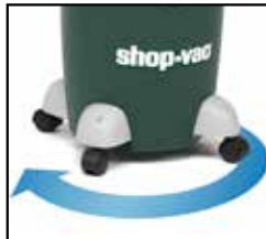
360° Easy glide caster system