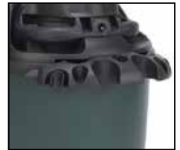
On board tool storage keeps you organized