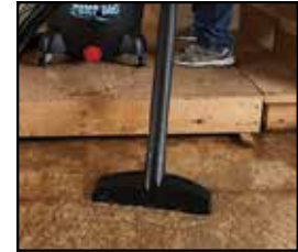
PICK IT UP