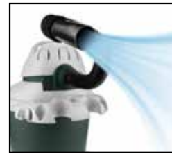
Powerful rear blower