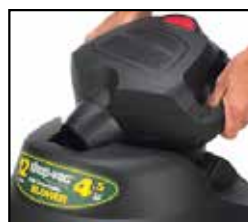
Detachable blower, quick and easy

Accessories: 7' (2.1 m) x 1 1 / 4 " (3.2 cm) Lock-On® hose, (3) 1 1 / 4 " (3.2 cm) extension wands, 10" (25.4 cm) wet/dry nozzle, (1) 2 1 / 2 " (6.4 cm) extension wand, concentrator nozzle, blower nozzle, tool holder, foam sleeve and ProLong® cartridge filter.