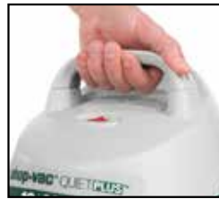
Built in top carry handle